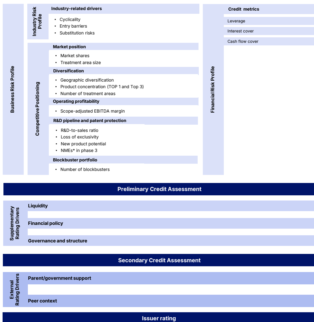
Figure 1: General rating grid on innovative pharmaceutical corporates

Because of fundamental differences between innovative and generic pharmaceutical companies, we provide different rating drivers for each segment below. In our rating analysis, we assess a pharma company's management, including its track record. A solid track record is a positive factor for the rating and provides us with some confidence in management's forecasts. Although a pharma company's corporate governance structure cannot drive up the rating, it is nevertheless important when determining credit ratings. While adequate corporate governance is considered a minimum standard for rating companies, weak corporate governance is likely to put downward pressure on a rating.